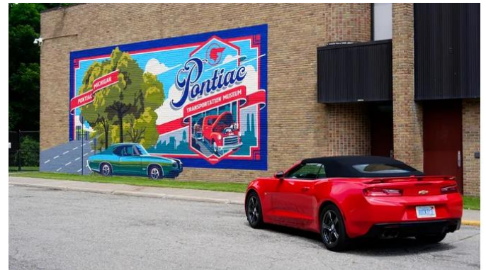
The Pontiac Transportation Museum's grand opening is July 27 and features a collection of vintage Pontiac cars, military vehicles and other transportation artifacts from Pontiac's history, Thursday, July 18, 2024.